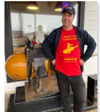
Standing proudly after negotiating the 'com dog' at Pronto Pup in Rockaway Beach.