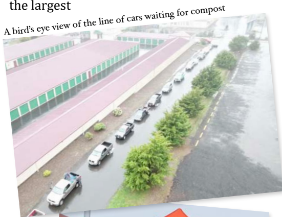
A bird's eye view of the line of cars waiting for compost

The event started at 9:00am and vehicles were lined by 7:45am waiting for their free load of compost, which were limited to one per family. This year, Thompson's arranged for two semi-truck loads of compost, instead of it's usual one, to be trucked over from Pacific Region Compost (PRC) outside of Corvallis, the largest