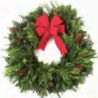
Wreaths Remove wires, bows