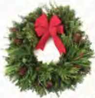
Wreaths Remove wires, bows