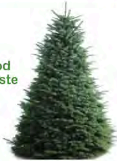
Christmas Tree leave at curb next to cart