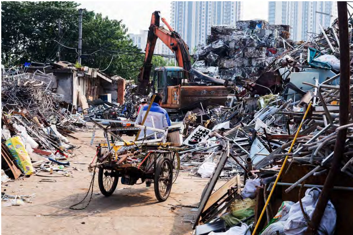
An informal recycling center in Shanghai. But though China may be amply ready for this shift, many countries have apparently been caught with their pants down.