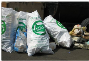
Just some of the trash collected during our SOLV Adopt-a-River cleanup of the Yaquina River.

As a TSS customer, you can also visit our website at thompsonsanitary.com and fill out our Refrigerator Pick-up Form under our "Services" tab. Once you submit that, we will contact you about taking away your fridge or freezer.