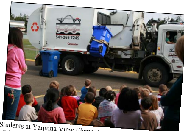
Students at Yaquina View Elementary getting a demonstration of the recycling truck dumping recyclables from "Big Blue".