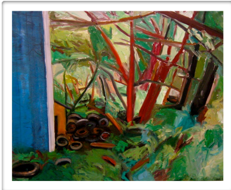
"Bud's Property" 45" x 60" Oil on Canvas