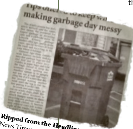
Ripped from the Headlines: Newport News Times article "Tips offered to keep wind from making garbage day messy" published January 4, 2012.